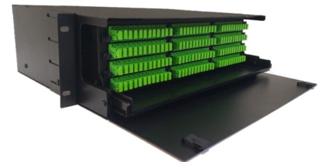
IFRMPP144SCS Fiber Patch Panel, 144 Ports SC Simplex