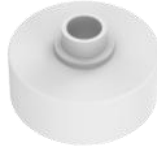
Junction Box IJBDCM-115