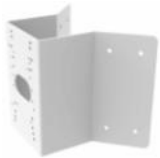
Corner Bracket IBCRWM