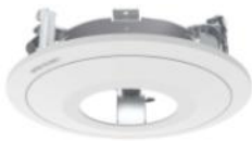
Ceiling Bracket IBDCF-2