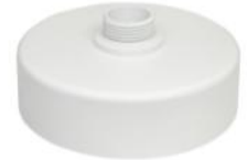
Junction Box IJBBCM-146