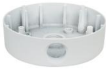
Junction Box IJDWM-146