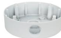
Junction Box IJDWM-146